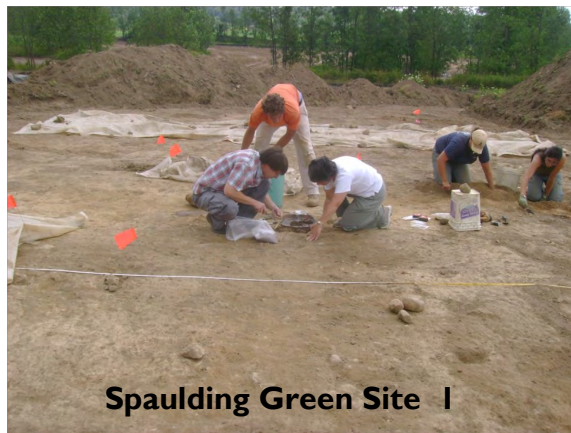
Spaulding Green Site I